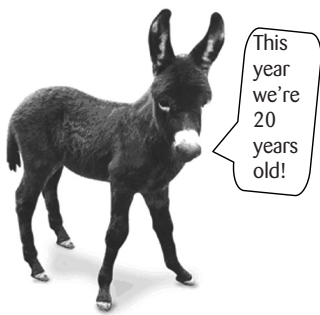
'please help me' J-A.K ©1989